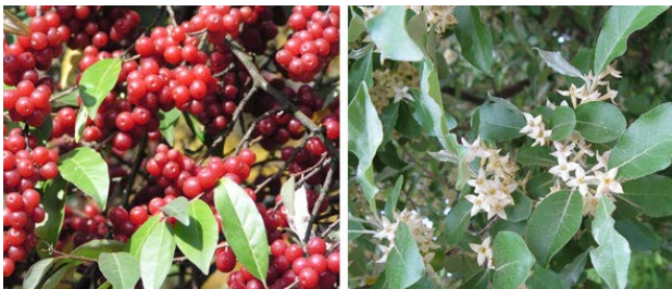
Invasive Autumn Olive

Now is a good time to check the roadway on your property and trim back any vegetation that is near the road. The more that you do the less we need to pay for. Remember, keep the Autumn Olive and Stilt grass under control and enjoy the summer weather.