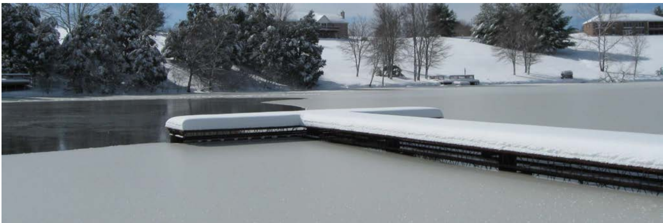
More snow? ... Seriously!!?