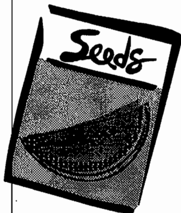
Time to work on the garden spot again ...